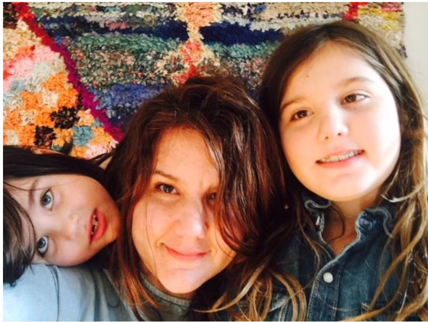
Beautiful Mama + kiddos.