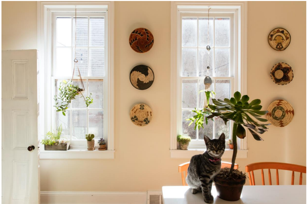
A basket collection hangs on the light-soaked walls, and some friendly greenery in the kitchen.