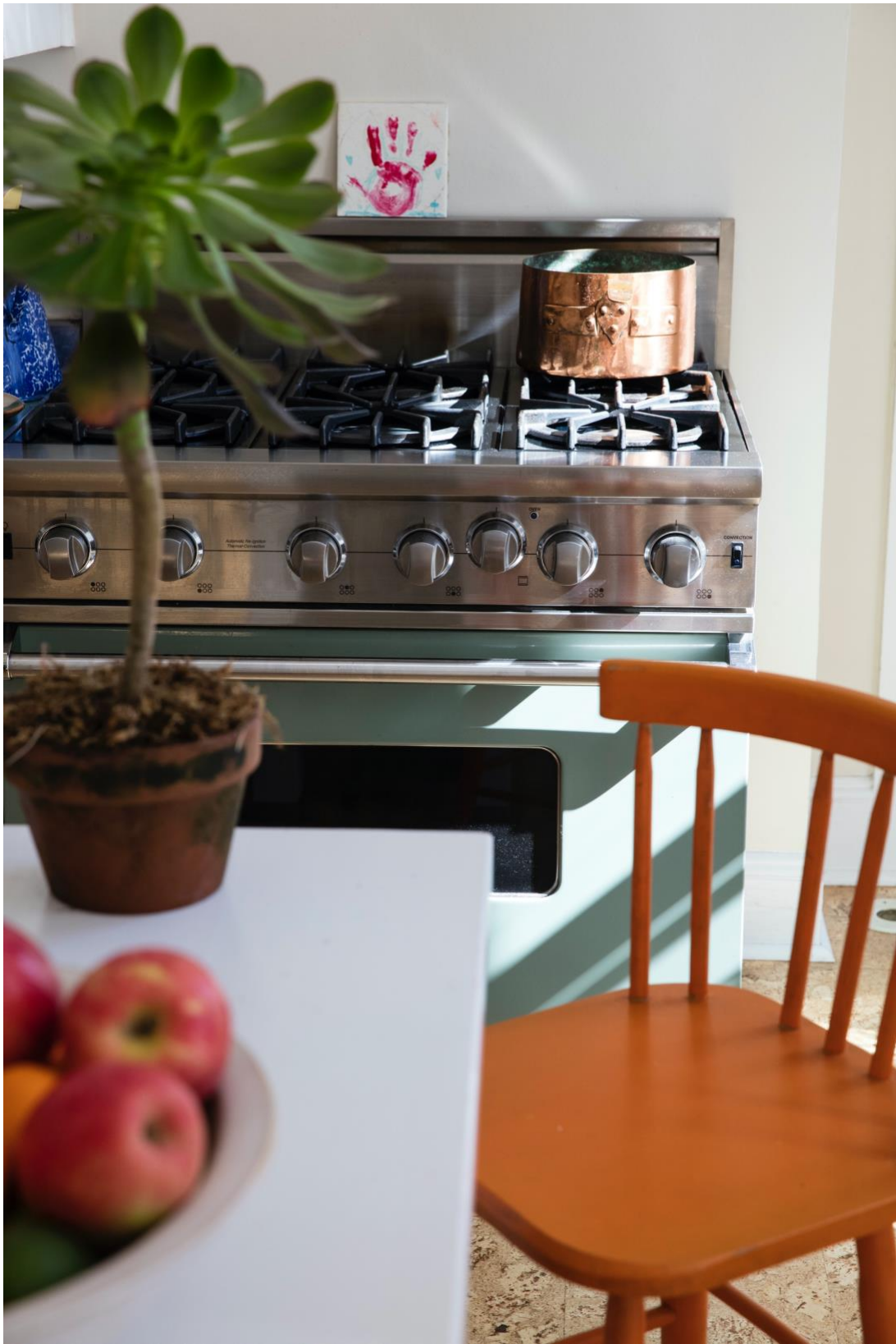
Artistic kids caught red-handed.