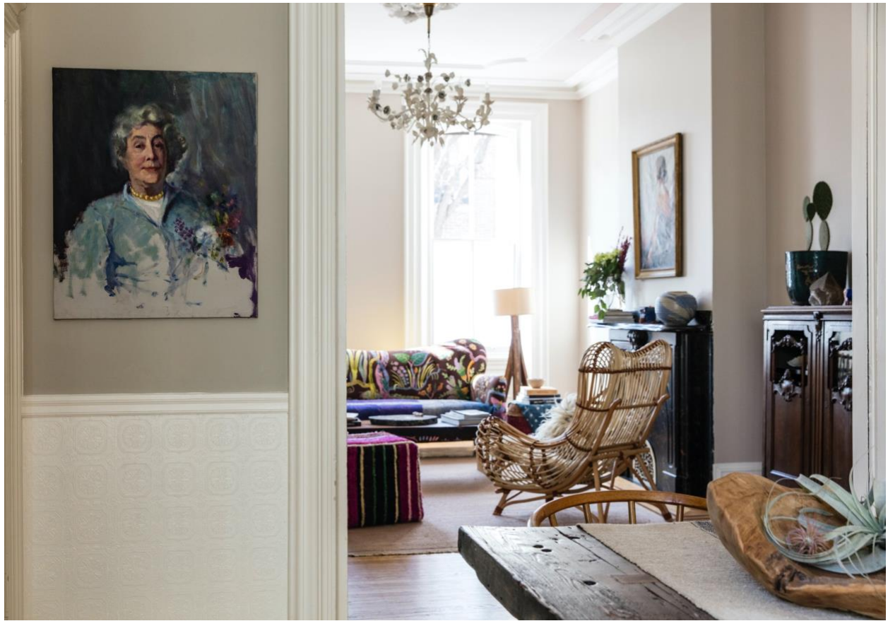
Conversational from every corner.