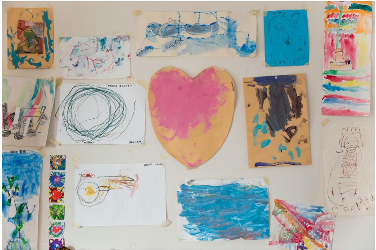
The best kind of art.