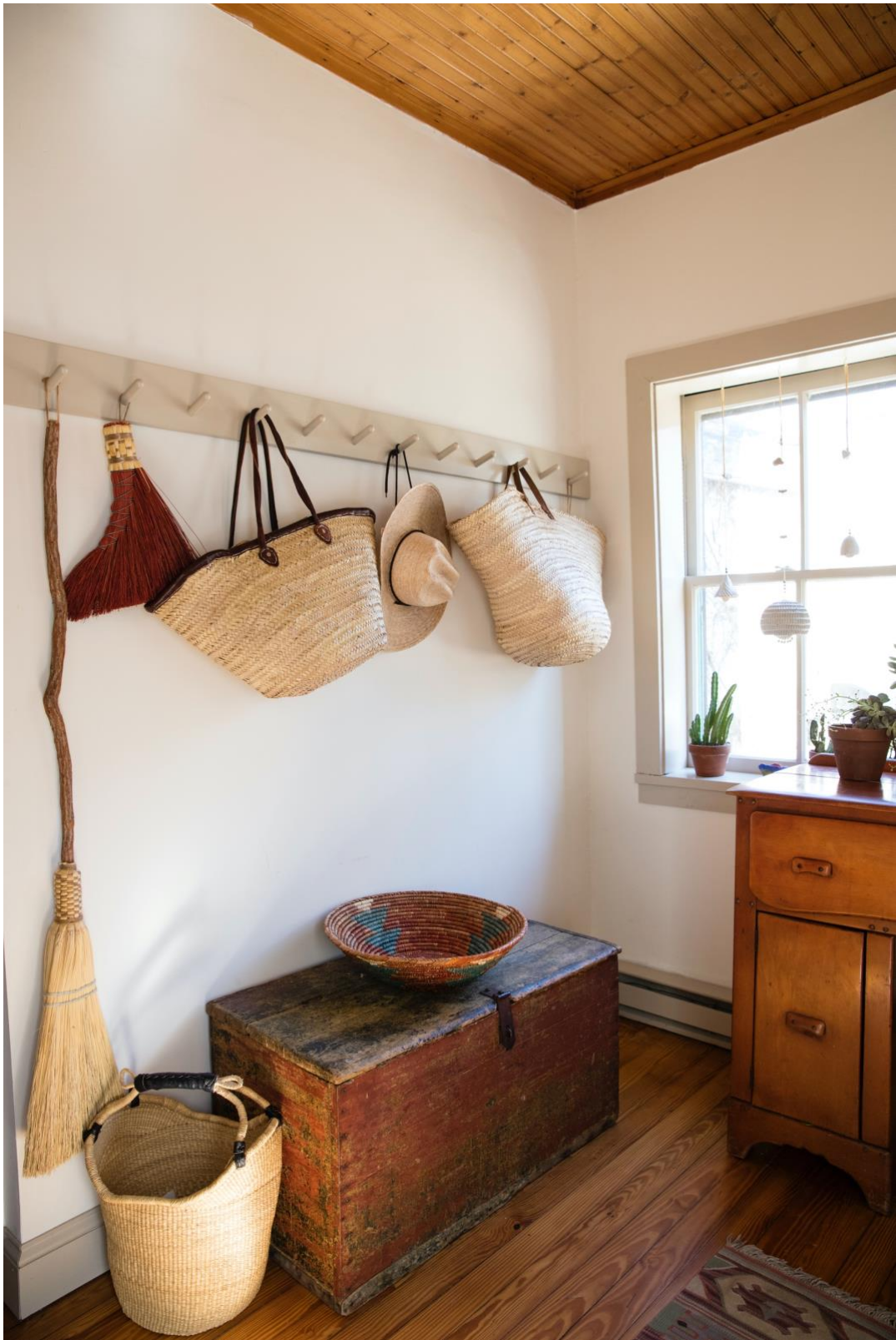
Pretty brooms and basket-storage.