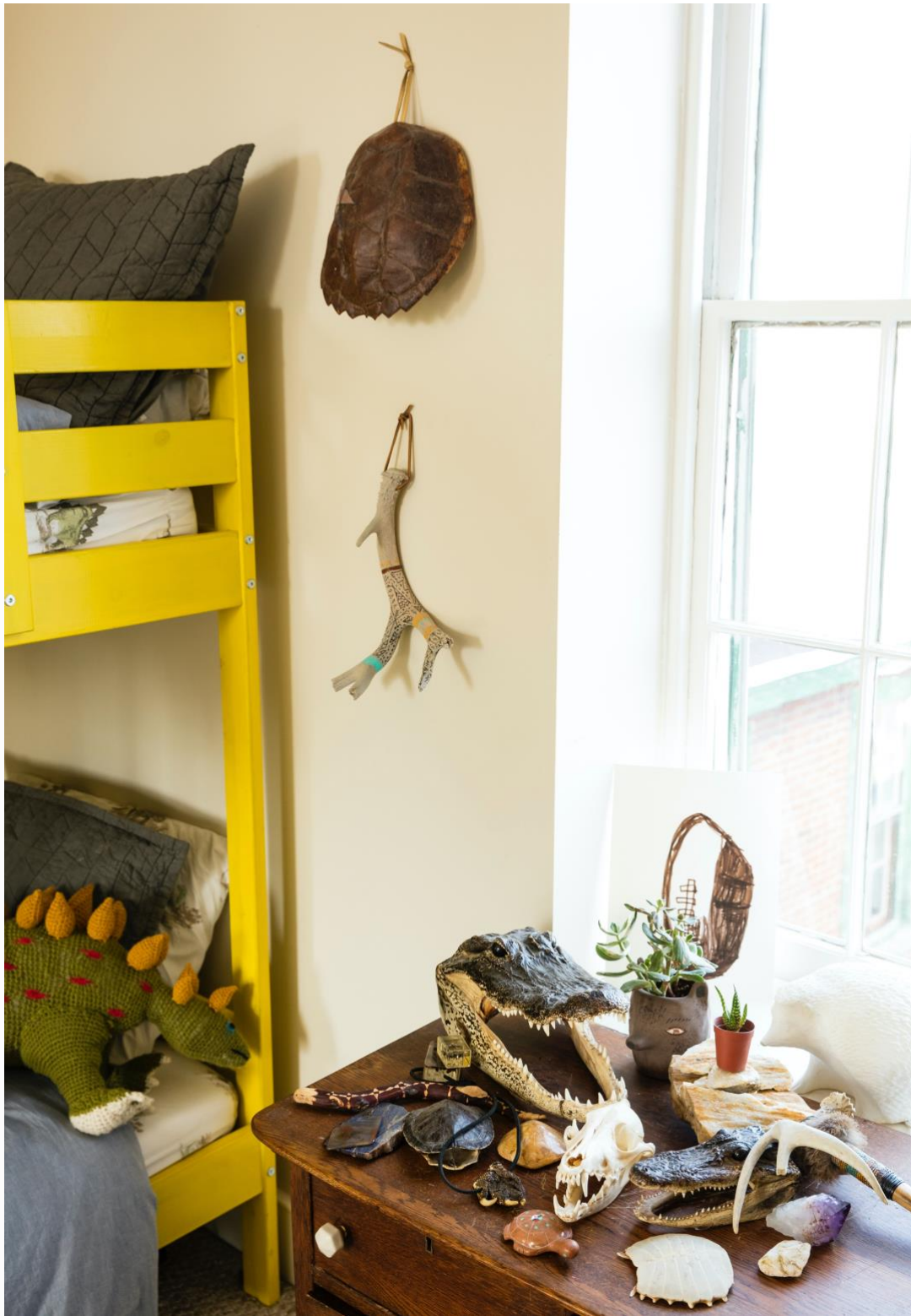
A boy's collection in Ashley's son's room.