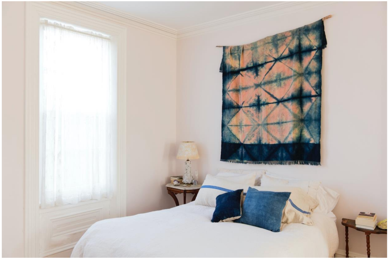
Relaxed elegance in the Master Bedroom.